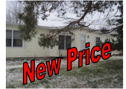
713 N. Center $67,000