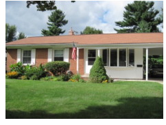
2113 Belaire $75,000