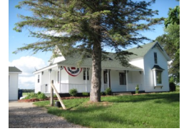
413 E. Curtis $89,900