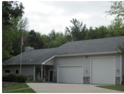
2188 Ashby $340,000

3 bedroom 1 1/2 story 4 car heated garage