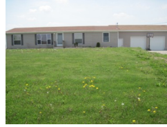
1667 Townline 14 $94,000 Bay County