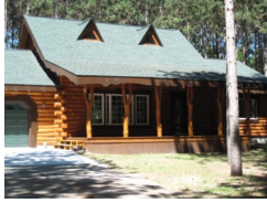
4300 Wieman $156,900