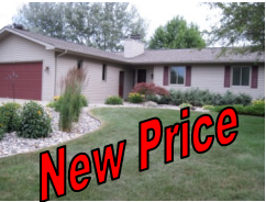
4410 E. Brooks $189,900