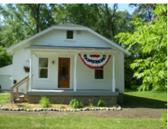
310 Arbury Place $59,900