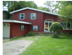
1508 Eastlawn $79,900