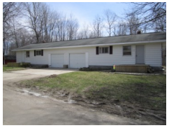
2021/2023 Patterson $89,000