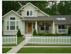
5306 Plumtree $299,900