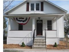
1114 State $68,900