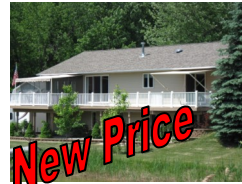
1271 E. Shearer $279,000

Stunning raised ranch 10 acres & 2 ponds