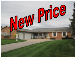
4066 Francis Shores $319,900

3 bedroom 1 1/2 story 4 car heated garage