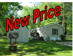
953 W. Maple Crest $39,900