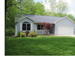
44 Spring St. $129,900