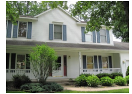
4905 Amberwood $219,900

Stunning raised ranch 10 acres & 2 ponds